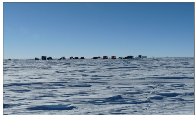
The OIR camp

For more information, please visit the website of the European project “Beyond EPICA oldest ice” here