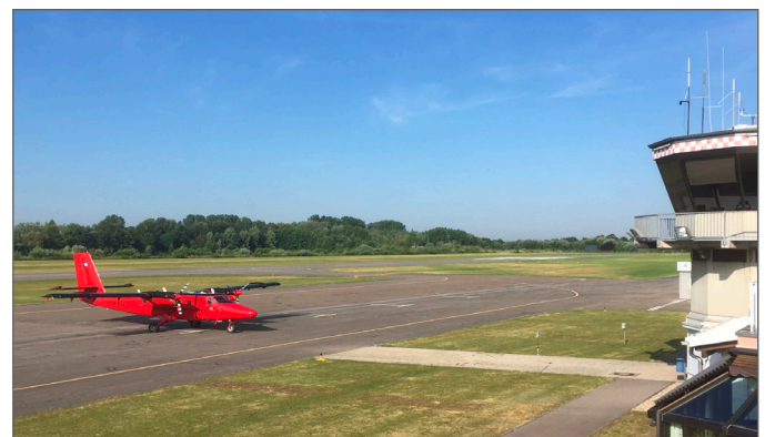
The BAS Twin Otter at Straubing Airport for EUFAR RS4forestEBV flight