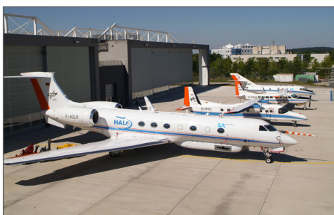
DLR research aircraft parked at Oberpfaffenhofen.