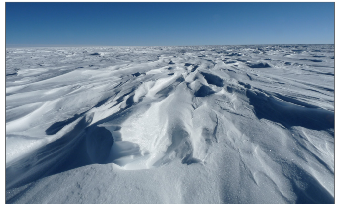
Typical surface of the ice sheet sculpted by the wind in the vicinity of the Dome Fuji and the OIR camp

The OIR magnetic data is of higher resolution and, after processing in the coming months, we expect that it will improve knowledge of the geology of the bedrock for this parts of the continent as for example the enhancement of possible contacts and sutures within the area.