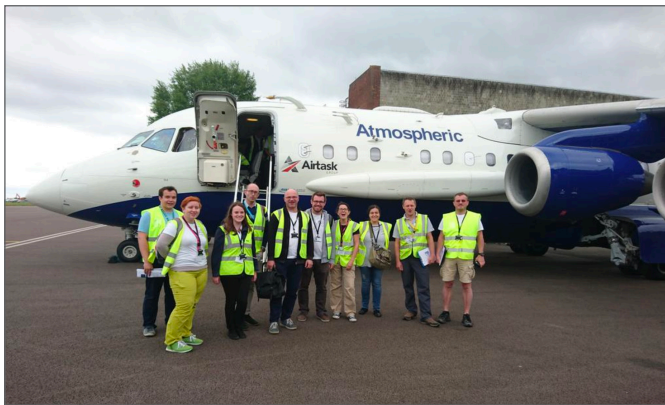
On board FAAM Aircraft- EUFAR STANCO Summer School

To download the STANCO flyer and photobook, click here .