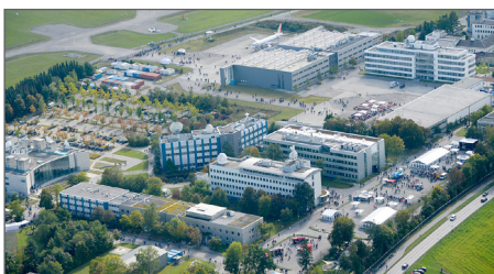
Aerial shot of DLR premises, Oberpfaffenhofen.

The conference will review the scientific drivers for future airborne measurements across a broad range of topics in environmental science. There will also be sessions devoted to a range of technical and support issues that are concerned with developing aircraft operators' ability to address these science drivers.