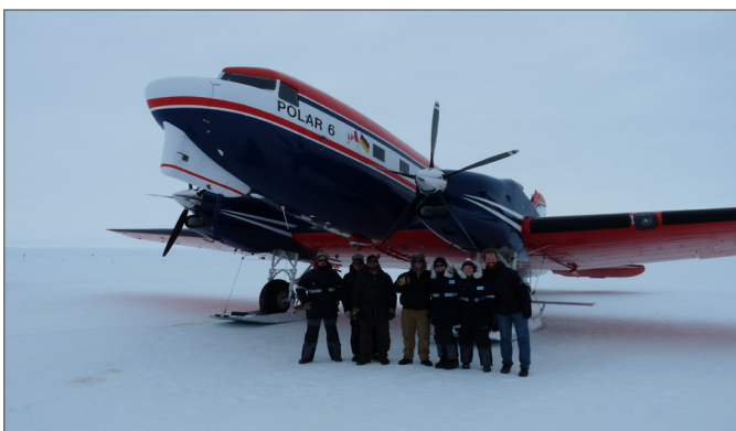
The crew and the scientists of the OIR project in front of AWI's Polar 6 aircraft

At the end of 2016, European, American and Chinese institutes started to compete for the quest of the oldest continuous ice record on Earth in order to get 1 to 2 Ma of climate record. The first step was to select a site potentially containing such a record. The criteria to determine the most suitable site are thick ice sheet coupled with low snow accumulation rate, slow ice motion and low geothermal heat flow enabling low temperature at the bottom of the ice sheet. The area around the Dome Fuji in East Antarctica fulfilled these criteria. The second step consisted in an airborne campaign to map the thickness of the ice sheet, the topography of the bedrock and get an insight into its geological characteristics. To carry out the airborne survey in such a remote area, complex logistics were necessary to set up a temporary camp and to supply it with fuel to enable multiple flights, and supply engines and electricity. The camp was located at 30°E and 79°S, at an altitude of 3500m and at a 10-day traverse from the Kohnen summer station.