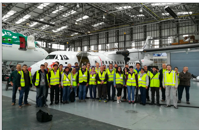
EUFAR EASI Summer School students and trainers