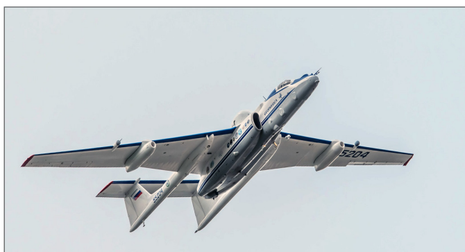
M55 - Geophysica aircraft operated by Myasishchev Design Bureau

Although the use of high altitude aircraft is not best suited for a continuous monitoring of the upper atmosphere, which has indeed to rely on the satellites, airborne stratospheric observations are beneficial for satellite validation, with particular emphasis on products from limb viewing satellites, and for fast deployment of proof of concept instruments and retrieval and data fusion exercises. Moreover, aircraft observations may help to fill the future potential gap in limb sounding satellite instruments.