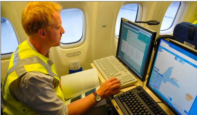
EUFAR EASI Summer School working session on board ATR42 (SAFIRE)

Funded by EUFAR and jointly organised with CNR-ISAC , the primary goal of the EASI summer school was to teach and train participants on the use of a research aircraft, and on the experimental possibilities it opens for atmospheric sciences research. This implied providing participants with a complete overview of airborne and remote sensing experimental techniques, and of specific features of collection and analysis of airborne measurements. In addition, EASI aimed to transfer consolidated knowledge on and recent advancements in specific topics related to air-sea interaction, and near coastal boundary layer structure and dynamics. 4 flights with the instrumented ATR42 aircraft (operated by SAFIRE) from the Shannon airport and a visit to the Mace Head Atmospheric Research Station were operated. Click here , to download the flyer and the photobooks