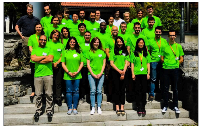
EUFAR RS4forestEBV Summer School students and trainers

Click here , to download the RS4forestEBV flyer and photobooks